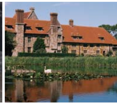
Pevensey Castle www.english-heritage.org.uk 01323 762604