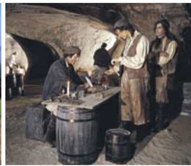
Smugglers Adventure www.discoverhastings.co.uk 01424 422964