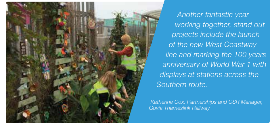
Angmering Station partners Sidetracked were nominated for the 2018 ACoRP Awards

The Station Management Team are also very supportive. At Hove station, staff decorated their Christmas tree with hand-knitted baubles which commuters could take home for a small donation to Chestnut Tree House Children's Hospice. 2019 projects will include murals to brighten up station underpasses.