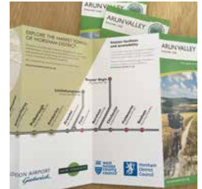
The Arun Valley line guide highlights Horsham District market towns

In May, HDC officers joined SCRIP at London Bridge Station for 'Community Rail in the City' handing out literature to visitors and commuters. SCRIP and the Arun Valley Line Group look forward to exciting collaborations in 2019, HDC's Year of Culture.