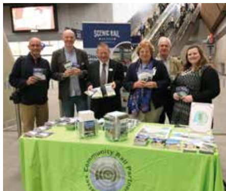
Community Rail in the City at London Bridge.

SCRCP's increased size and turnover has led the Board to strengthen our fundraising and finance capability by appointing a specialist officer and introducing an on-line personnel and financial system. This will equip us for the future and deliver statutory and management information requirements. We also aim to diversify our income by attracting alternative grant funding.