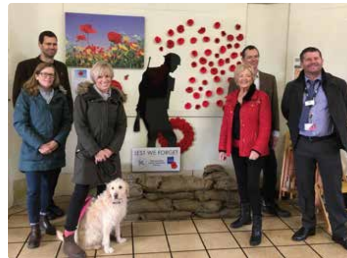
Community members gather at Bishopstone to commemorate the First World War

After a year of hard work, community volunteers, railway staff, the Railway Heritage Trust, the planning officer and support from ACoRP have started us on the road to restore this forgotten Grade II listed Art Deco station into a community hub. SCRCP built momentum, interest and engagement through a schools exhibition of pinhole photography and platform clearance days with Network Rail. The Friends of Bishopstone are now creating a plan to take this challenging project forward.